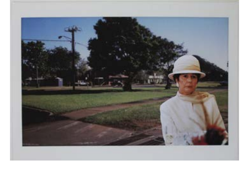
Alana Hunt Between me and you 2017 series of 15 images collage on enlarged polaroids printed on canson edition etching rag and mounted on aluminium 37 × 29 (per image) Courtesy of the artist This artwork has been generously supported by Culture and the Arts WA, a division of the Department of Local Government, Sport and Cultural Industries.